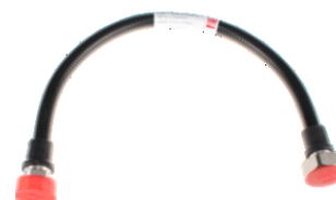
Picture shows 7M7FS12-0100FFP for illustration purpose

Radio Frequency Systems' CELLFLEX® Factory-Fit Jumpers feature specially designed connectors which are soldered-on in a strictly controlled industrial process to ensure industry leading performance for today's high-performance wireless systems. The connector design and manufacturing process has been optimized to produce premium VSWR and IM levels. Injection molded boots provide reliable and repeatable additional sealing level and strain relief. Our facilities produce and stock all popular lengths as required by the industry, and can deliver custom lengths with premium VSWR and IM levels on request.