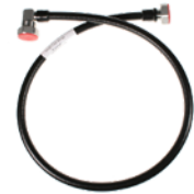
Picture shows 7M7MRS12-0100FFP for illustration purpose

Radio Frequency Systems' CELLFLEX® Factory-Fit Jumpers feature specially designed connectors which are soldered-on in a strictly controlled industrial process to ensure industry leading performance for today's high-performance wireless systems. The connector design and manufacturing process has been optimized to produce premium VSWR and IM levels. Injection molded boots provide reliable and repeatable additional sealing level and strain relief. Our facilities produce and stock all popular lengths as required by the industry, and can deliver custom lengths with premium VSWR and IM levels on request.