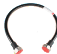
Picture shows 7M7MS12-0100FFP for illustration purpose

Radio Frequency Systems' CELLFLEX® Factory-Fit Jumpers feature specially designed connectors which are soldered-on in a strictly controlled industrial process to ensure industry leading performance for today's high-performance wireless systems. The connector design and manufacturing process has been optimized to produce premium VSWR and IM levels. Injection molded boots provide reliable and repeatable additional sealing level and strain relief. Our facilities produce and stock all popular lengths as required by the industry, and can deliver custom lengths with premium VSWR and IM levels on request.