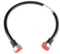
Picture shows 7M7MS12-0100FFP for illustration purpose

Radio Frequency Systems' CELLFLEX® Factory-Fit Jumpers feature specially designed connectors which are soldered-on in a strictly controlled industrial process to ensure industry leading performance for today's high-performance wireless systems. The connector design and manufacturing process has been optimized to produce premium VSWR and IM levels. Injection molded boots provide reliable and repeatable additional sealing level and strain relief. Our facilities produce and stock all popular lengths as required by the industry, and can deliver custom lengths with premium VSWR and IM levels on request.