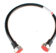
Picture shows 7M7MS12-0100FFP for illustration purpose

Radio Frequency Systems' CELLFLEX® Factory-Fit Jumpers feature specially designed connectors which are soldered-on in a strictly controlled industrial process to ensure industry leading performance for today's high-performance wireless systems. The connector design and manufacturing process has been optimized to produce premium VSWR and IM levels. Injection molded boots provide reliable and repeatable additional sealing level and strain relief. Our facilities produce and stock all popular lengths as required by the industry, and can deliver custom lengths with premium VSWR and IM levels on request.