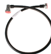
Picture shows 7M7MRS12-0100FFP for illustration purpose

Radio Frequency Systems' CELLFLEX® Factory-Fit Jumpers feature specially designed connectors which are soldered-on in a strictly controlled industrial process to ensure industry leading performance for today's high-performance wireless systems. The connector design and manufacturing process has been optimized to produce premium VSWR and IM levels. Injection molded boots provide reliable and repeatable additional sealing level and strain relief. Our facilities produce and stock all popular lengths as required by the industry, and can deliver custom lengths with premium VSWR and IM levels on request.