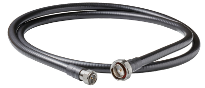
7M43MS12-0600FFP for EXAMPLE

Radio Frequency Systems' CELLFLEX® Factory-Fit Jumpers feature specially designed connectors which are soldered-on in a strictly controlled industrial process to ensure industry leading performance for today's high-performance wireless systems. The connector design and manufacturing process has been optimized to produce premium VSWR and IM levels. Injection molded boots provide reliable and repeatable additional sealing level and strain relief. Our facilities produce and stock all popular lengths as required by the industry, and can deliver custom lengths with premium VSWR and IM levels on request.