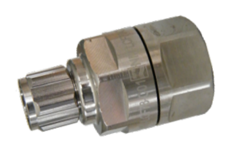
OMNI FIT™ Standard Connectors